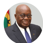
Nana Akufo-Addo, President of Ghana