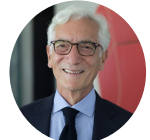
Sir Ronald Cohen, Sustainable Finance Leader