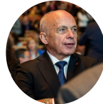
Ueli Maurer, Minister of Finance Switzerland