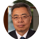
Xiangchen Zhang, Deputy DG WTO