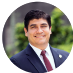
Carlos Alvarado, President of Costa Rica