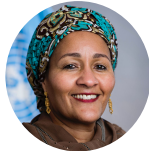
Amina Mohammed, UN Deputy Secretary General