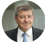
Guy Ryder, Director General ILO