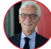
Sir Ronald Cohen

Chair of The Elders, former President of Ireland, & former UN High Commissioner for Human Rights